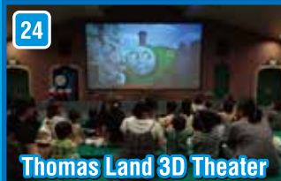
24 Thomas Land 3D Theater