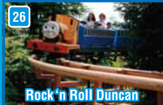
26 Rock 'n Roll Duncan